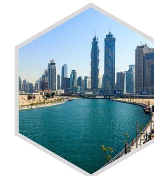
Water-Canals, Ponds Dams, Reservoirs