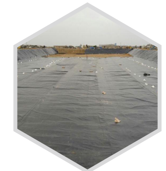
Landscaping- Capping, munciple Waste, Garbage Based