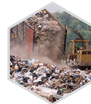
Waste Management Treatment